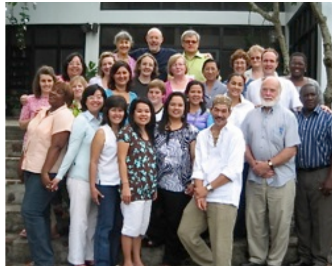
Colleague from Africa